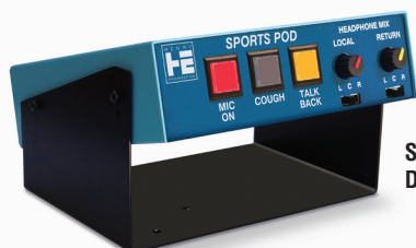
Shown with optional Desk Mount

Specifications subject to change without notice.