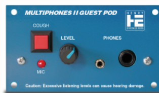
Guest Pod can be mounted in cabinet cut-out