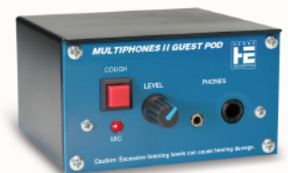
Guest Pod mounted in desk-mount chassis, included